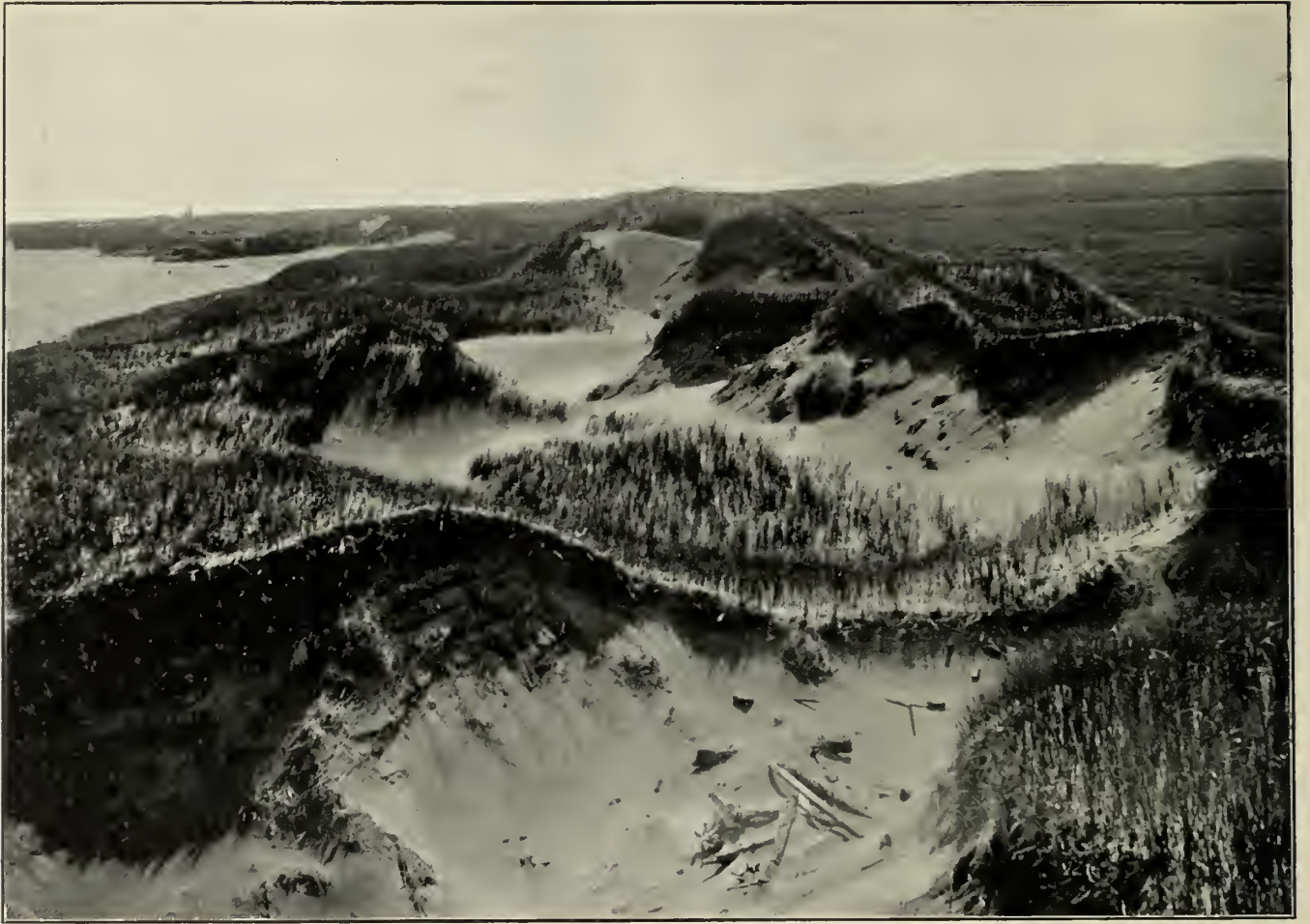
THE SAND DUNES OF PRINCE EDWARD ISLAND.